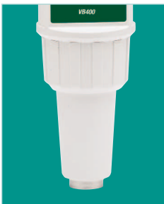
Magnetic base included